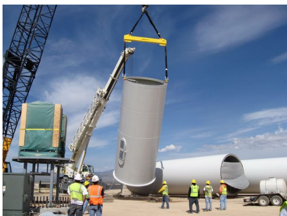
The construction process for a large community wind project requires the hiring of experienced installers.

Though the construction process can vary, it typically involves multiple steps that can include site preparation, running and trenching of cable, foundation engineering and construction, electrical upgrades for interconnection, tower erection, nacelle and hub attachment, blade assembly and attachment, and site restoration.