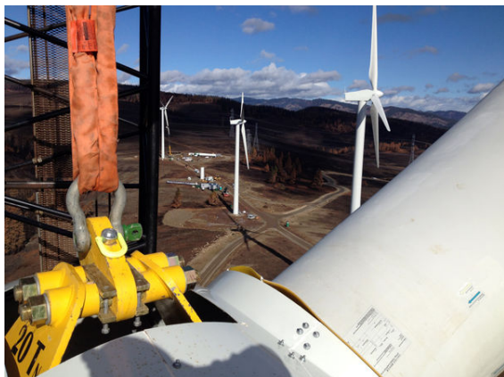
A variety of factors will influence turbine selection.

Turbine selection and procurement rely on multiple project-specific factors, turbine availability, and whether manufacturers are willing to provide turbines for smaller projects.