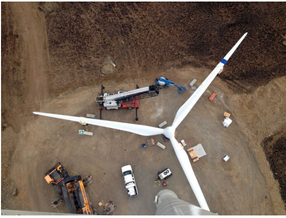
Turbines at Swauk Creek Ranch generate community-scale power.

There are multiple ways to secure a PPA, including: