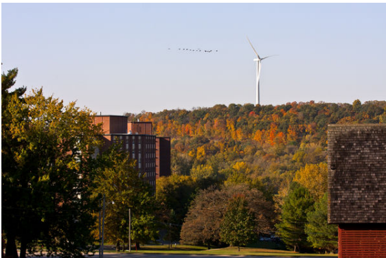
A thorough understanding of local regulations can help ensure project success.

Officials or other local parties may pose questions while you navigate the permitting and zoning process for a large community wind project. Questions can pertain to project design, environmental impacts, natural and cultural resource impacts, setbacks, sound requirements, and overall aesthetics. It is important to be prepared early in the development of your project to address concerns.