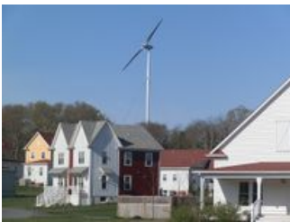
The Sandywoods community in Rhode Island features a community wind project.

Community wind projects are locally owned developments consisting of turbines that can vary in number, type, and size. Historically, these projects have been utilized to supply local electricity for a variety of applications, including schools, hospitals, businesses, farms, ranches, or community facilities. Rural electric cooperatives or municipal utilities have also developed their own community wind projects to diversify electricity supplies. Community wind owners may also be local individuals who form independent power producer groups or limited liability corporations to sell the power the turbines produce to a local electricity supplier. [1]