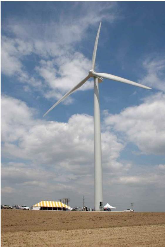
Illinois Rural Electric Cooperative (IREC) is the owner and power purchaser of this 1.65-MW Vestas turbine in Pike County, Illinois.

Since wind energy projects can be sited on 10 to 80 acres per megawatt (MW) of installed capacity, [15] an understanding of the land use and ownership of your development's location is an important step. Large community wind projects can be sited on land owned by multiple individuals; thus it is vital to engage surrounding property owners to determine general attitudes regarding wind energy, whether or not they would like to be involved in the project, as well as current and planned use of the property.